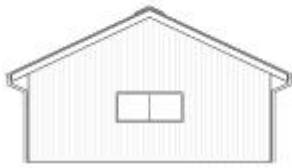
(N) ELEVATION OPTIONAL