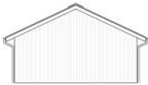
(S) ELEVATION OPTIONAL