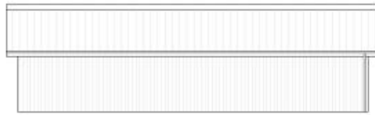
(E) ELEVATION OPTIONAL

THIS DRAWING IS THE PROPERTY OF HOLIOGREEN ARCHITECTS. IT IS TO BE USED ONLY FOR THE PROJECT AND SITE SPECIFICALLY IDENTIFIED. ANY REUSE OR MODIFICATION WITHOUT THE WRITTEN PERMISSION OF HOLIOGREEN ARCHITECTS IS STRICTLY PROHIBITED.